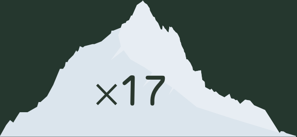
44.7 million metric tons of e-waste were generated in 2016 — equivalent to 4,500 Eiffel Towers, which, when stacked, is 17 times higher than Mount Everest.